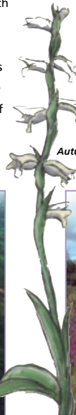
Autumn Ladies Tresses

Heathland and its associated mosses and lichens are very susceptible to trampling. Please keep to paths. Bylaws that apply to the commons are published separately and should be adhered to.